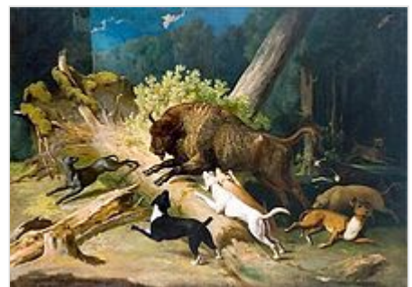
Bison hunted by dogs

Other animals have alternative self-protection methods. Some species of cold-blooded animals change color swiftly to camouflage themselves. [43] These responses are triggered by the sympathetic nervous system , but, in order to fit the model of fight or flight, the