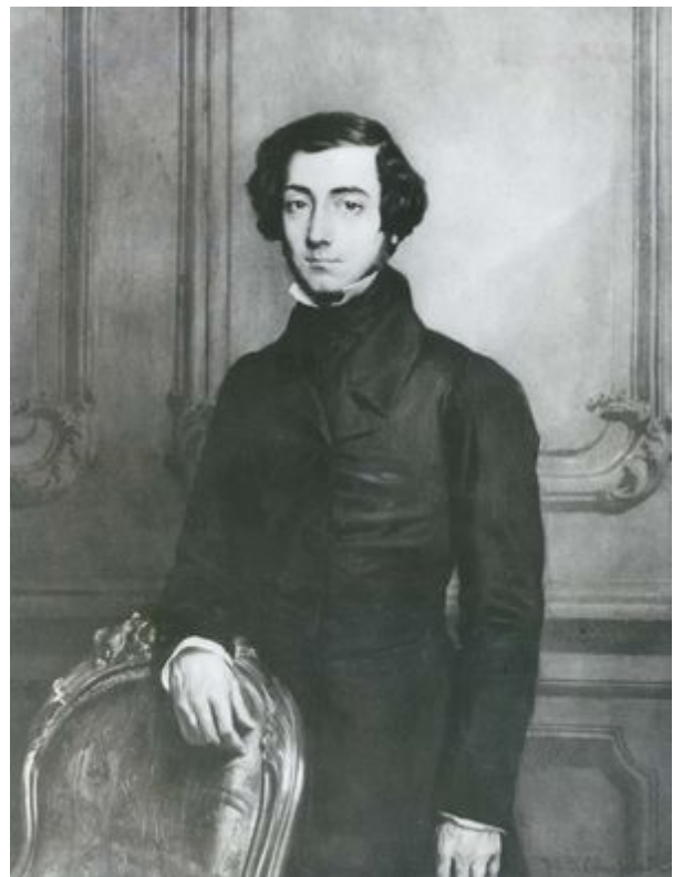
Alexis de Tocqueville

These, then, are the principal themes in the 19th-century writing that may be seen as direct results of the two great revolutions. As themes, they are to be found not only in social thought but, as noted above, in a great deal of the philosophical and literary writing of the century. In their respective ways, the philosophers Georg Wilhelm Friedrich Hegel ,