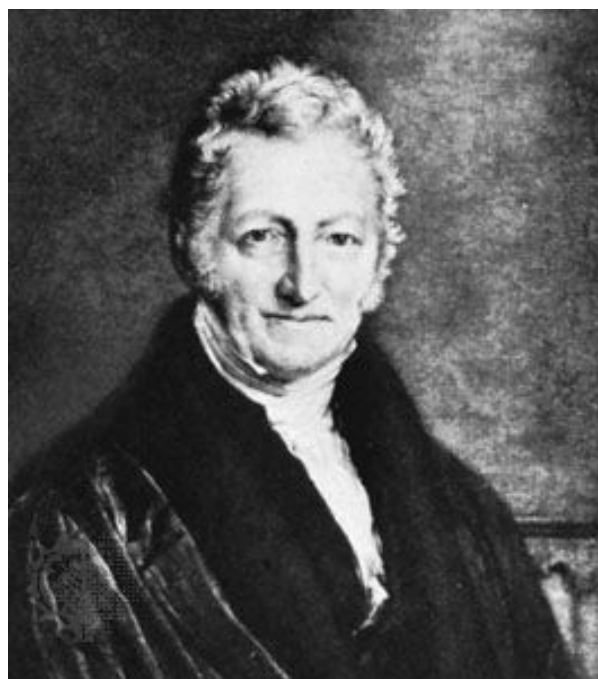
Thomas Robert Malthus

First, there was the great increase in population . Between 1750 and 1850 the population of Europe went from 140 million to 266 million and of the world from 728 million to well over 1 billion. It was an English clergyman and moral philosopher (considered economist), Thomas Malthus , who, in his famous Essay on the Principle of Population (1798), first marked the enormous significance to human welfare of this increase. With the diminution of historic checks on population growth , chiefly those of high mortality rates —a diminution that was, as Malthus realized, one of the rewards of technological progress—there were no easily foreseeable limits to growth of population. And such growth, he stressed, could only upset the traditional balance between population, which Malthus described as growing at a geometrical rate, and food supply, which he declared could grow only at an arithmetical rate. Not all social thinkers in the century took the pessimistic view of the matter that Malthus did, but few if any were indifferent to the impact of explosive increase in population on economy, government, and society.